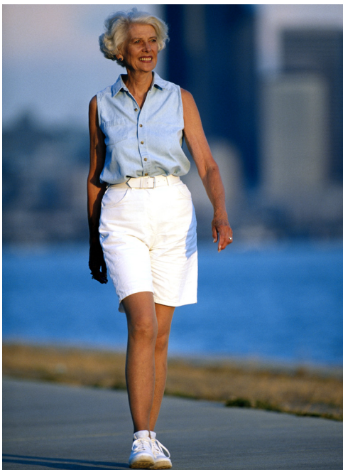
Before you begin vigorous activity, warm up with a brisk walk or gentle stretching.