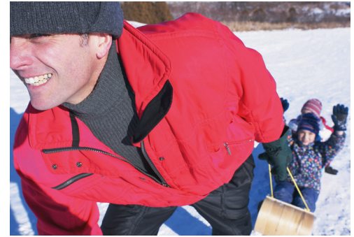
Counter the effects of stress with energetic family play.